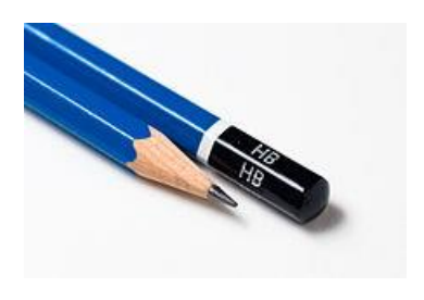
The pencil is one of the most basic graphic design tools.

Aside from technology, graphic design requires judgment and creativity. Critical, observational, quantitative and analytic thinking are required for design layouts and rendering . If the executor is merely following a solution (e.g. sketch, script or instructions) provided by another designer (such as an art director ), then the executor is not usually considered the designer.