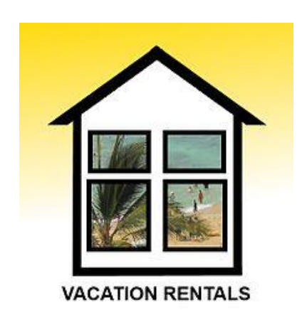
Example of graphic arts created with the free tool, Paint.net

Graphic artists applying for positions in today's job market are expected to be familiar with computers and a variety of software programs in order to create the most appealing, up to date designs.