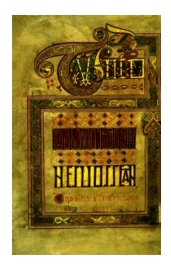
Page from the Book of Kells : Folio 114v, Decorated text. Tunc dicit illis

ingenuity-проницательность, сообразительность prowess-мастерство, умение а stove-плита, камин scripture-надпись а scroll-свиток, манускрипт movable type-наборный шрифт word of mouth-молва, в устной форме crier-уличный торговец, глашатай to credit for- признавать заслугу а solocitation-предложение, просьба lucrative-прибыльный, доходный to repudiate-отвергать, отказываться consumerism-потребление, потребительство